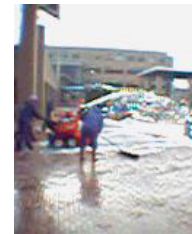
A student shows friends at home that it really can snow in Tokyo