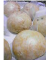
A college girl shows off homemade sweet bean dumplings

of her new haircut: "How does this look?"