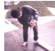
An embarrassing moment caught on film: He just fell into a puddle