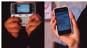
Audio & Photos

Students and Technology, Constant Companions